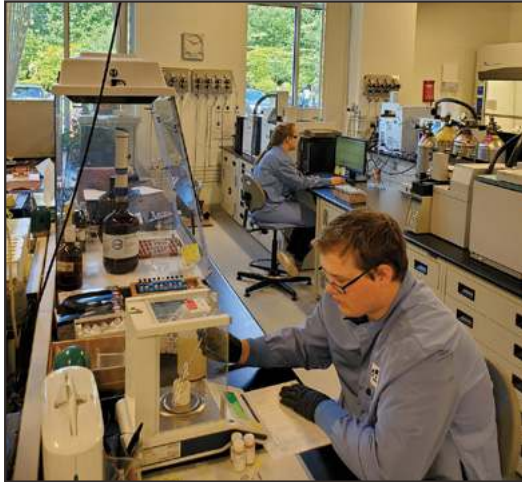
Doble Materials Laboratories, established in 1933, can perform over 200 laboratory tests on both solid and liquid insulation