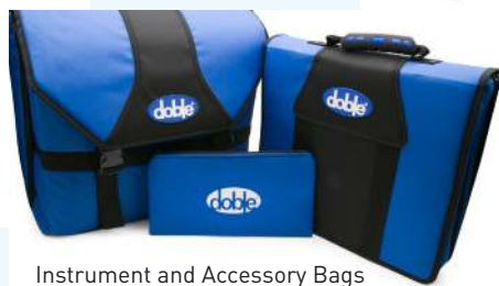
Instrument and Accessory Bags