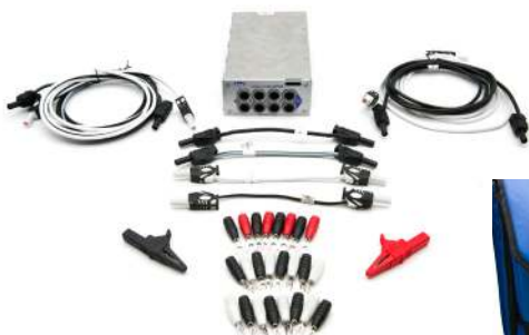
Logic I/O Module Accessories