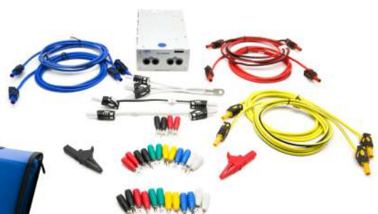
Current Module Accessories